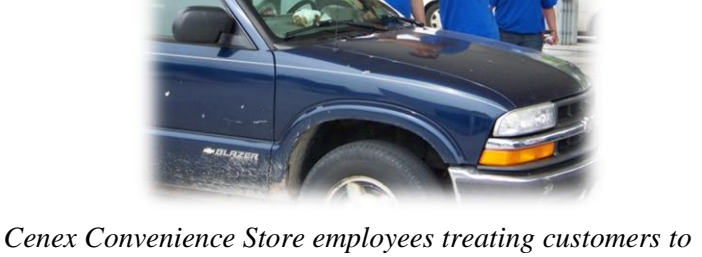
full service at the pumps

To celebrate the opening of the new, bigger, improved store, Cenex hosted an open house with a fry-out and the service of having your gas pumped for you.