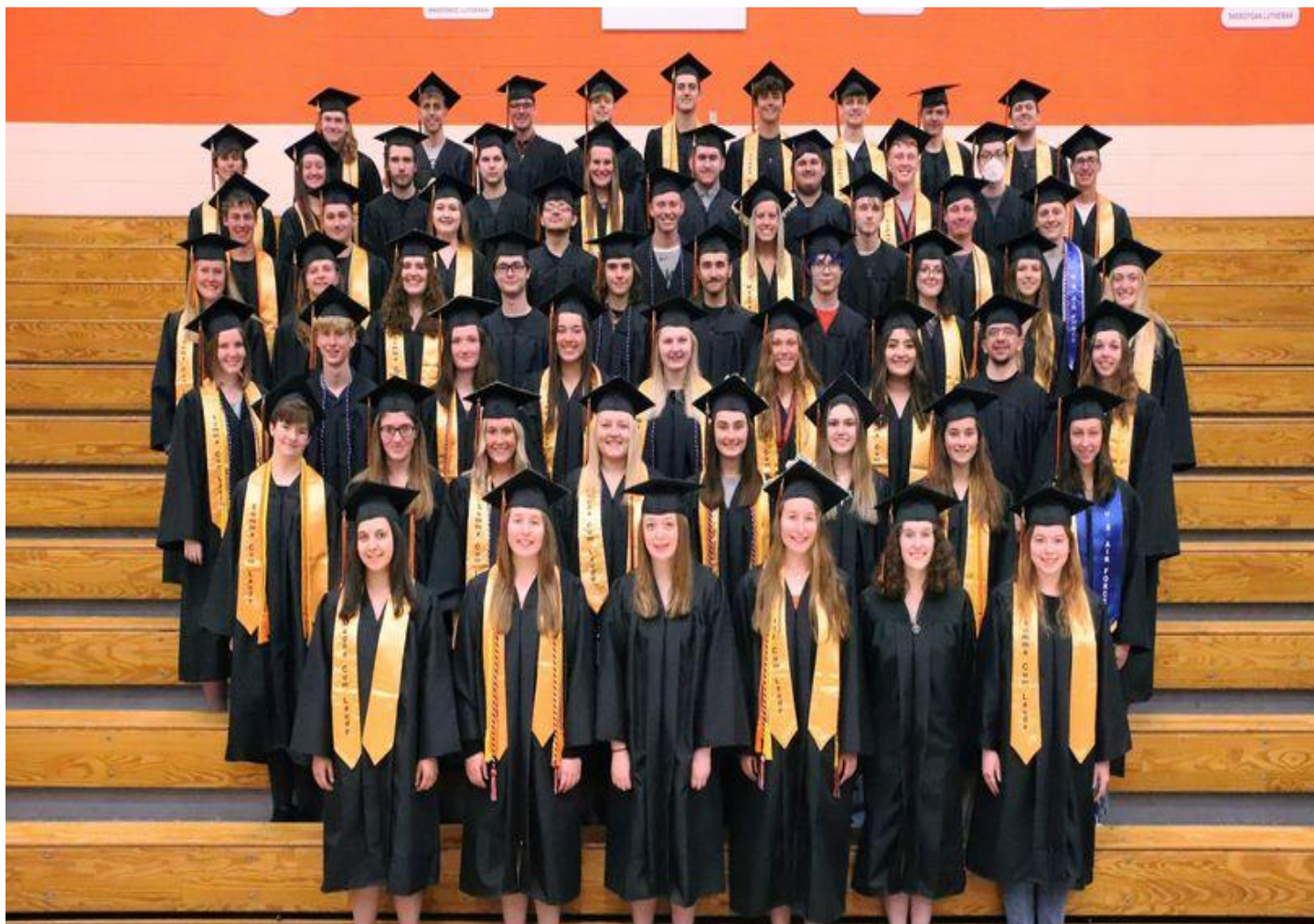
Mishicot High School - Class of 2022