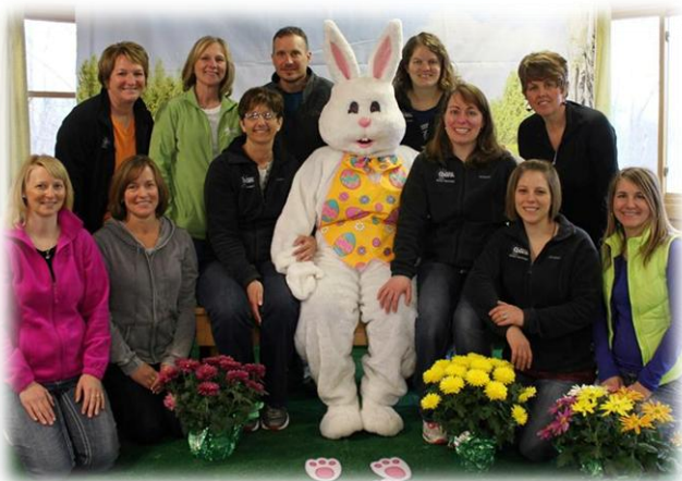
Mishicot Dental hosted the Easter Egg hunt at the VFW on April 12