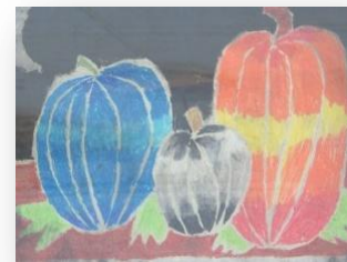
Mishicot student artwork displayed around village for Pumpkinfest.

Thank you to all the businesses and residents who cooperated with the Main Street closure; donated services, electricity, materials, and/or the use of their premises to Pumpkinfest in 2012: