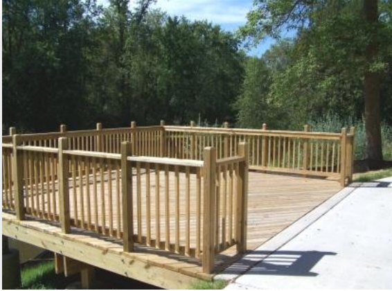
Deck along East Twin River

The RiverWalk path leading down to the East Twin River by the Mishicot VFW has been completed. There will be an additional improvement at the top of the walk where a stone memorial and benches are planned as well as three flagpoles bearing the United States, Wisconsin, and POW-MIA flags. Look for work to begin this spring.