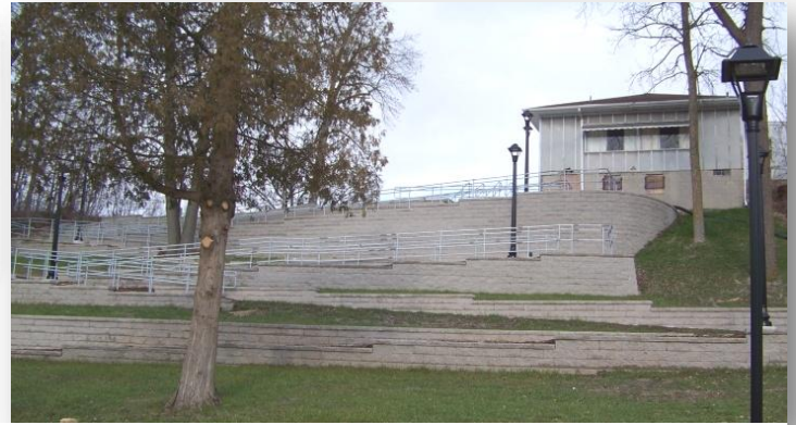
View from deck of new RiverWalk towards VFW hall