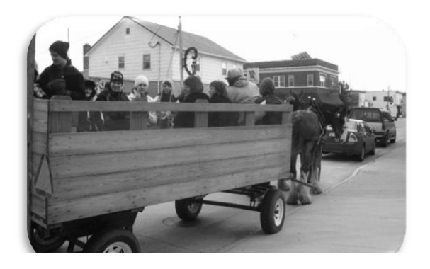
Carolers & shoppers ride in the horse drawn wagon during the 1<sup>st</sup> Annual Christmas in the Village event organized by the newly created MBA.

A tasteful way to help the Mishicot School District and enjoy a great pizza is to stop by the Mishicot Pizzeria on the second Thursday of each month to order a "Mishicot Pride" meal. You will get a large pizza any way you like it and two orders of breadsticks. The Mishicot Middle School will receive a 15% donation